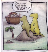
Don't miss the boat!